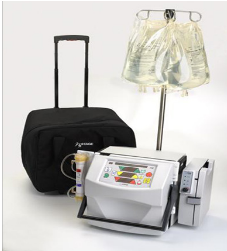
Figures 3,4 Today many difficulties of HHD seem to be overcome thanks to new technologies, such the NxStage System